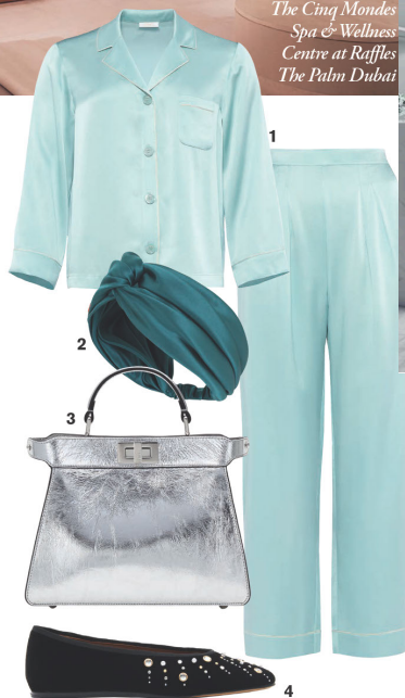
1 Pyjama top, £435, and bottoms, £370, ERES . 2 Head wrap, £365, EMILY-LONDON . 3 Bag, £3,200, FENDI . 4 Shoes, £450, LE MONDE BERYL