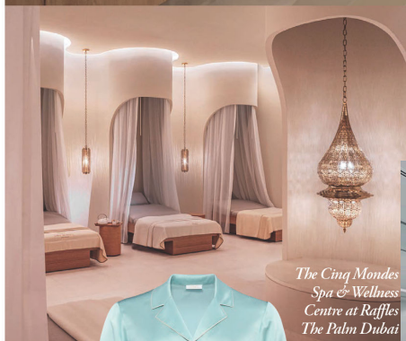
The Cinq Mondes Spa & Wellness Centre at Raffles The Palm Dubai

DUBAI IS HAVING A MOMENT. THIS PLAYGROUND of the affluent is attracting aesthetic clinics from Knightsbridge to Harley Street, ready to cater to the needs of a burgeoning society. 'There's a lot of eyes on Dubai right now,'