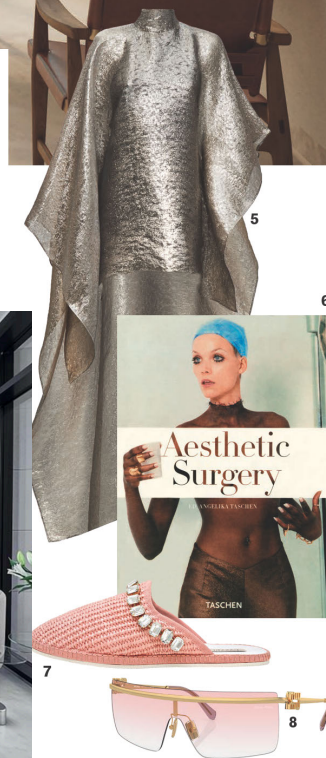
5 Kaftan, £1,160, TALLER MARMO . 6 Aesthetic Surgery by Angelika Taschen, ABE BOOKS . 7 Slippers, £400, CASADEI . 8 Sunglasses, £380, MIU MIU